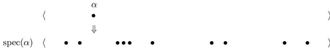
Figure A. Each real number \alpha determines \text{spec}(\alpha) , a countably infinite subset of the reals.